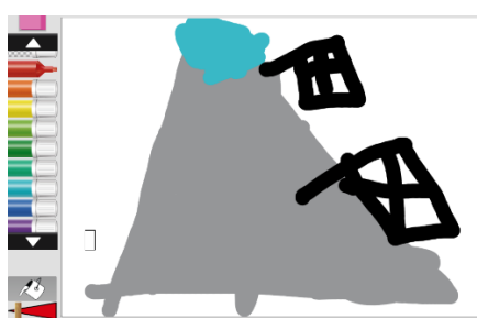
Mountains recording sheet